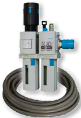
Art. Nr. 24203