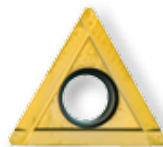
Art. Nr. 24204