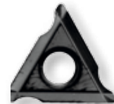
Art. Nr. 24202