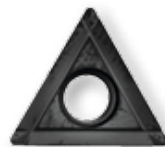
Art. Nr. 24201